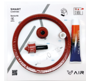
12 months maintenance kit SL310R1VSB0