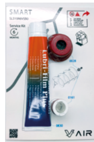
6 months maintenance kit SL310R6VSB0

Ensure the best performance of your S M A R T and a longer lifetime easily and economically with our preventive maintenance kits.